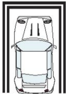
SINGLE SECURE CAR SPACE