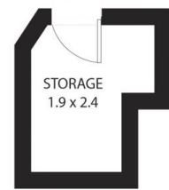
STORAGE 1.9 x 2.4 STORAGE ( private lock up on floor storage )